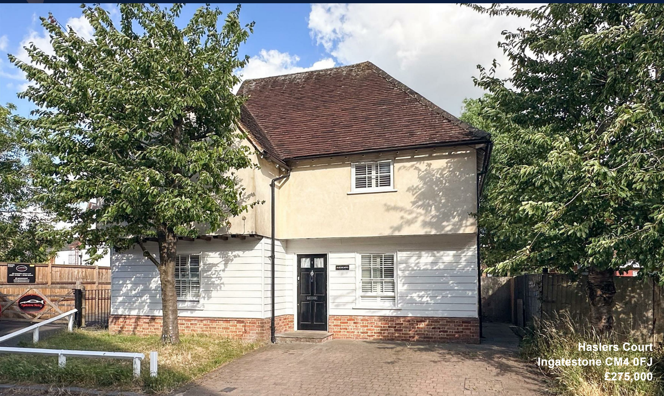
Haslers Court Ingatestone CM4 0FJ £275,000